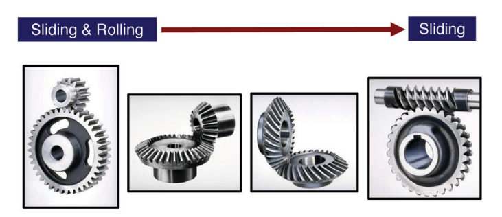
Figure 1 | Common Gear Types and their Frictional Characteristics

Each design carries its own strengths and weaknesses and imposes slightly different challenges to the lubrication and reliability engineer. The designs, as noted in Figure 1, from left to right, include a spur, a right-angle spur, a right-angle bevel gear and a worm gear. The degree of sliding force increases as the degree of curvature of the gear tooth increases, with the worm gear presenting complete sliding engagement.